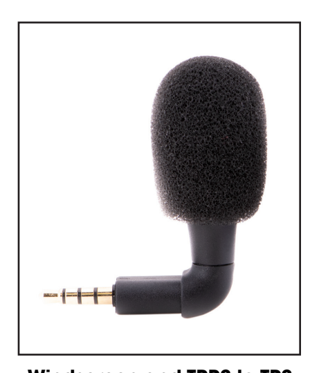
Windscreen and TRRS to TRS Adapter Included