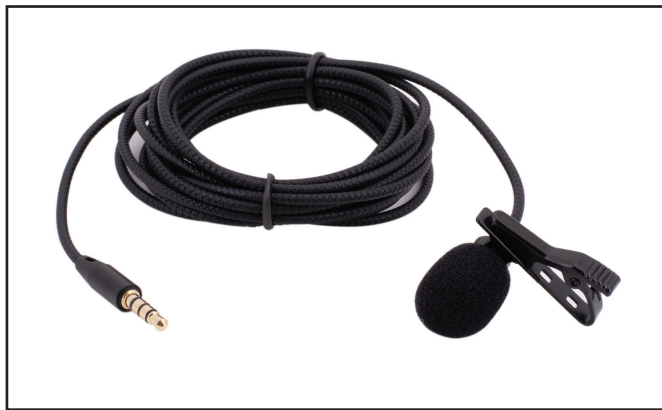
Windscreen and TRRS to TRS Adapter Included

†Specifications subject to change without notice.